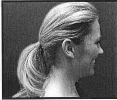
Low Ponytail, No Bangs, Side View