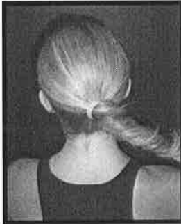
Starting at the base of the ponytail, twist the ponytail all the way down to its end.