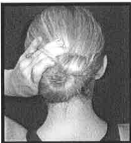
Continue the circular motion until a bun is formed. Hold bun securely.