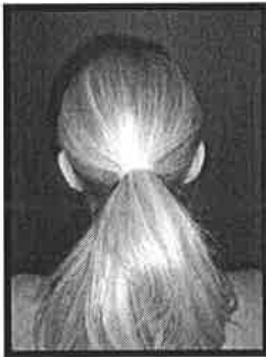
Start with a Low Ponytail.