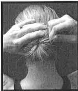
As you are holding bun securely, a hairnet around the bun is required. Put hairnet around bun and start by pinning down the loose end and continue to pin around the bun.