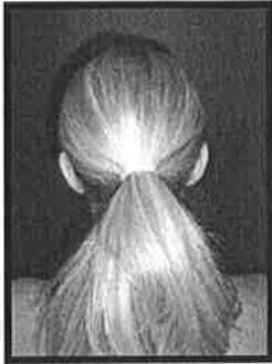
Low Ponytail, No Bangs