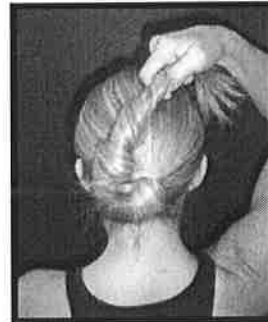
Take the twisted hair and wrap it around the base of the ponytail in a circular motion.